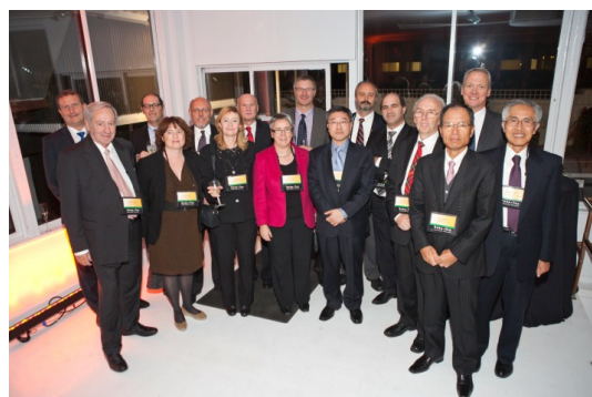
The OEKO-TEX® General Managers at this year's meeting in New York.

Detailed information about the resolutions of the meeting of the General Managers in New York can be obtained from the OEKO-TEX® Secretariat, email: info@oeko-tex.com .